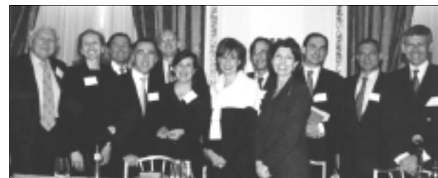
(left to right)

The recession, and the psychological impact of September 11th, emphasize the need for luxury brands to continuously reestablish their timeless value in today's marketplace. Endurance, high quality and great attention to details are central elements to developing a luxury brand - precepts that are as essential to strong, well-known brands as they are to newcomers.