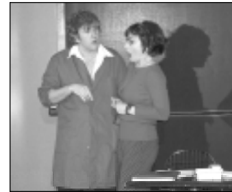
Des fusions et des hommes Cast of Guichets Fermés

financial or geographic values, without sufficient thought given to the human dimension. The play sends messages to firms contemplating a merger, or having just undergone one, as a preliminary to discussions on employee expectations and fears.