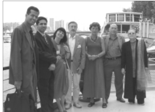
Dinner cruise participants

The summer equinox on 21st June is always celebrated in high style in Paris. People take to the streets to listen to music of all types at spontaneous and organized parties out in the open. Conference participants celebrated with a dinner cruise along the Seine that highlighted historic Paris.